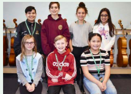
NMEA Division III