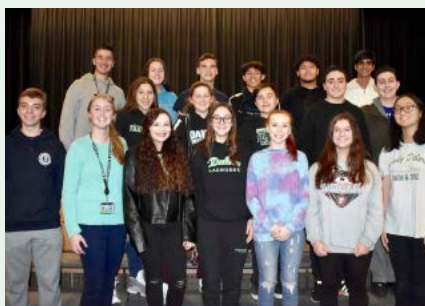
NMEA Division IV