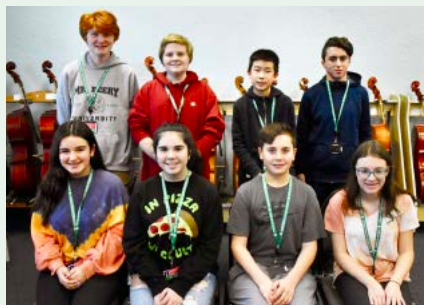
NMEA Division II