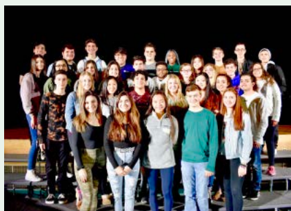
NMEA Division V