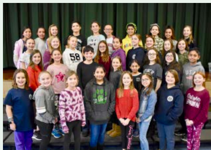
NMEA Division I

Farmingdale sent 101 students to the 2020 Nassau Music Educators Association (NMEA) All-County Music Festival, held at the Tilles Center in January. The festival brings music students together from schools throughout Nassau County. Students performed in five different divisions: Band, Orchestra, Chorus, Vocal Jazz, and Jazz Band.