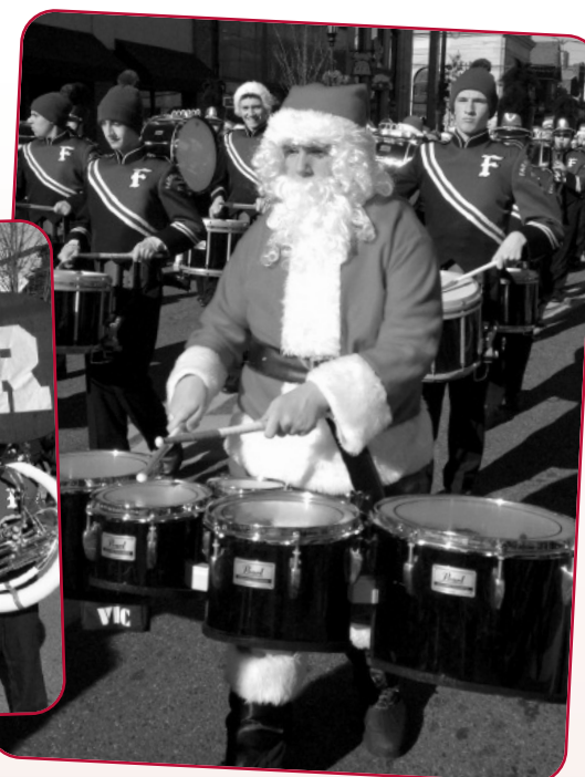
Even Santa Claus joined the Farmingdale Marching Band!