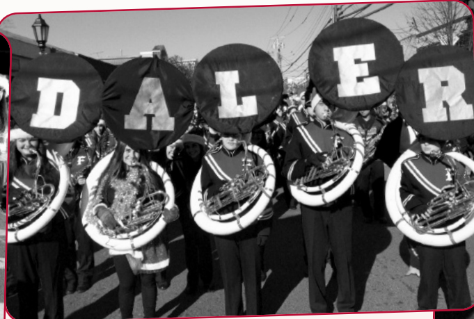
The band decked the halls—and the instruments—making everything festive.