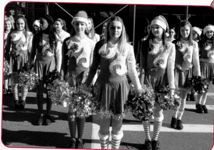
Dalerettes performed on Main Street in a similar style to the famous Rockettes of the Thanksgiving Day Parade.