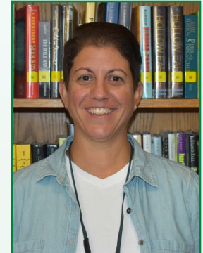
Nicole Pignataro Elementary Health Districtwide