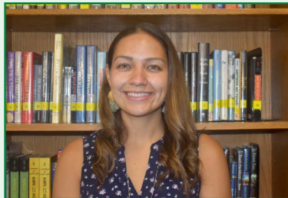
Alexandria Becker Saltzman East Memorial - English as a New Language