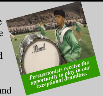
Percussionists receive the opportunity to play in our exceptional drumline.

There is something for everyone in the band program. We have a fantastic marching band, and once marching season is over, we focus on concert band literature. Our bands are comprised of a wide cross section of the general high school population, each with their own interest and diverse skills. This combination often helps students raise their level both musically and academically.