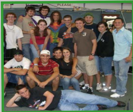
HS seniors developed lifelong friendships over the past four years.

The High School Band Program strives to meet the following criteria: