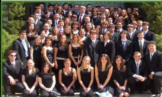
The High School Wind Ensemble poses for a picture after the NYSSMA Organization Festival at Hofstra University.

Students develop mathematical and literacy skills through the study of music. Students in quality music programs score 22% higher in English and 20 % higher in math on standardize tests mandated by the No Child Left Behind Act (University of Kansas).